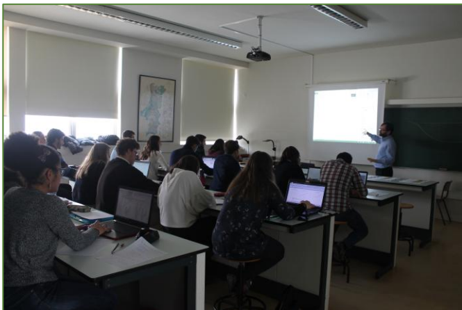
Classroom lectures and exercises