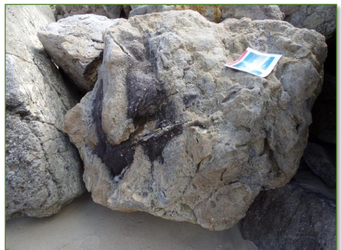
Oil seep in coarse sandstone reservoir