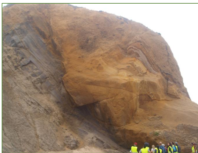
Channelized deepwater sandstone reservoir